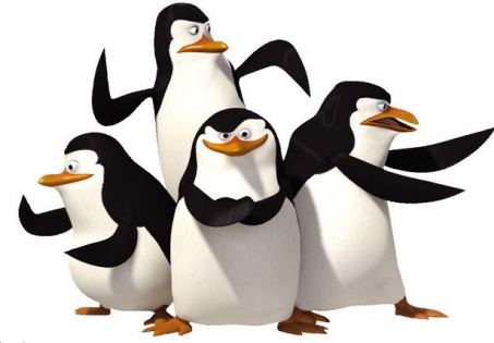
Left to right: Private, Kowalski, Skipper, Rico

Rico: very quiet; greedy; loves to eat. He hotwires the car